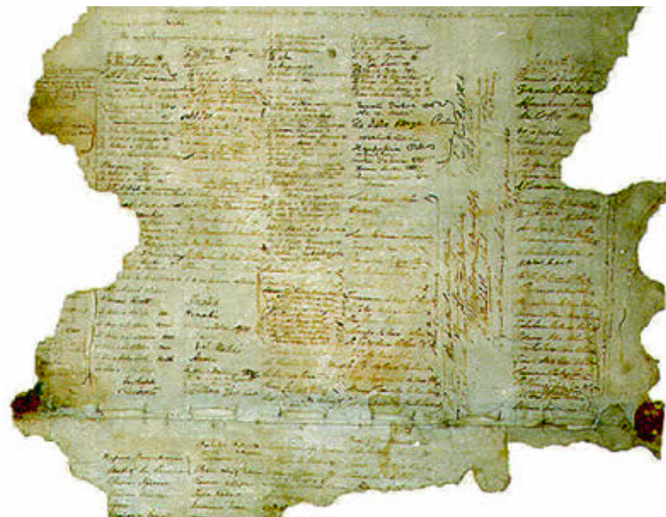
Te Tiriti o Waitangi signed by the British Crown and over 40 rangatira (chiefs) on 6 February 1840.